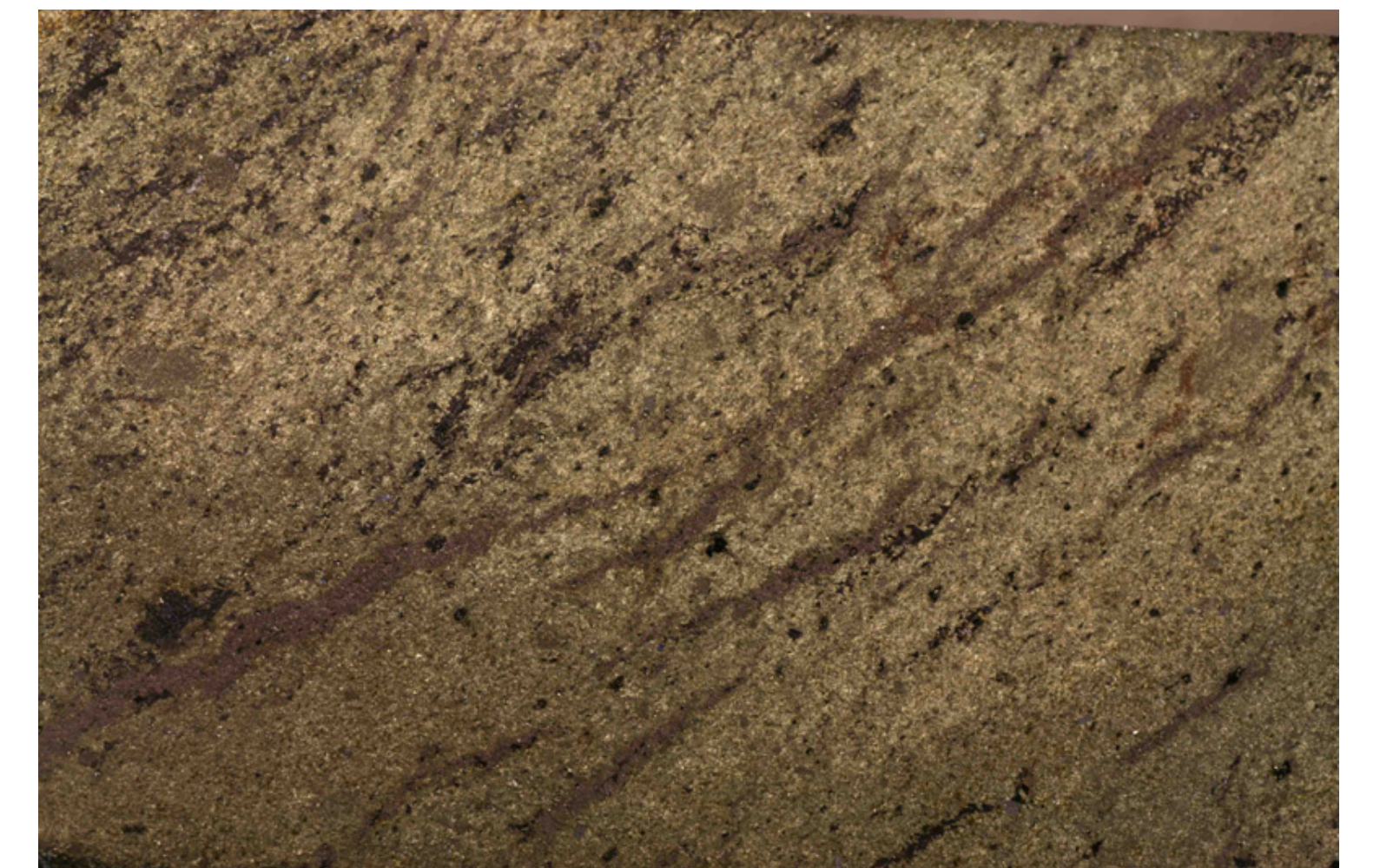
Typical Ming Massive Sulphide Mineralization (NQ Core)