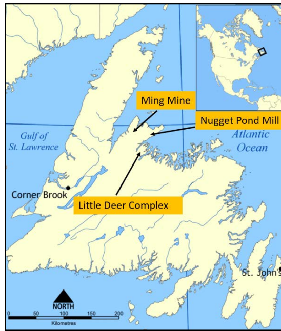
Figure 1: Location Map of the Little Deer Complex

Copper mineralization was first discovered at the Little Deer Complex in 1952 by Falconbridge Nickel Mines Limited. The Property was mined by British Newfoundland Exploration Company (“BRINEX”) from 1970 to 1972, with access via a 1,144 m drift on the 244 m level from the Whalesback mine to the north, and by Green Bay Mining Company from 1973 to 1974, with access via a 329 m decline.